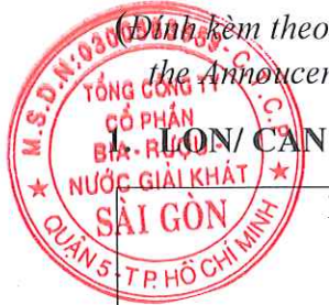
MẶT TRƯỚC/ FRONT

(Đính kèm theo Thông báo bổ sung nội dung Bản tự công bố sản phẩm ngày 06/10/2023/ Attached with the Announcement of additional of the Certificate of Self – Declaration dated on October 6 th , 2023)